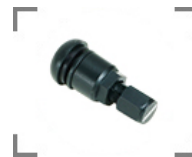
High Speed Air Control Valve RAYS New Logo BK

※Please refer to the "option parts" tab below.