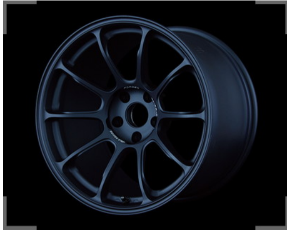
Matt Blue Gunmetal(The GB)